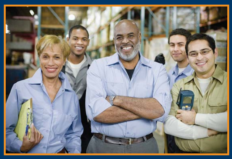
Advancing Wisconsin's economy and business climate by empowering and supporting the workforce.