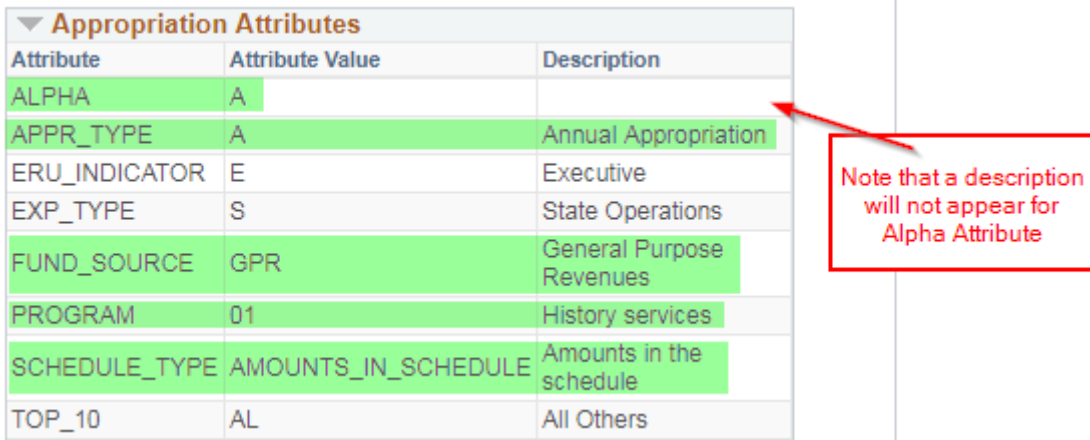
Figure 16-Form 78 Appropriation Attributes

If the agency reconciler believes that the appropriations EXP_TYPE or TOP_10 attribute is misclassified, or if any other attribute does not trace correctly to support in Chapter 20, please contact the SCO.